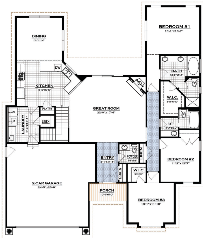
GROUND FLOOR PLAN 2,159 SQ. FT.